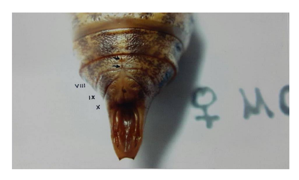
Figure 5 Femal genital aperture on the eighth abdominal sternum