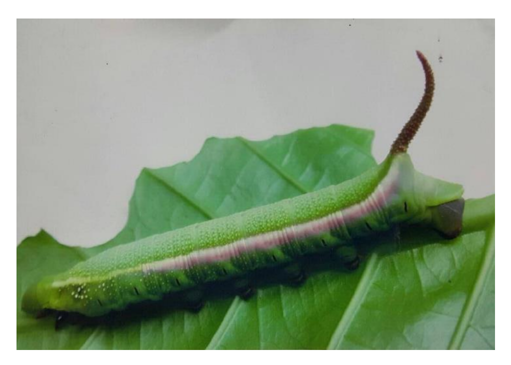
Figure 2 The dorsal horn on the 8<sup>th</sup> abdominal segment