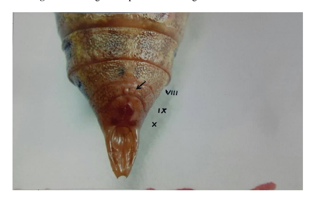
Figure 6 Male genital aperture on the ninth abdominal sternum

The body of adult has a length of 29-36 mm (average 30.67 mm) not including a fantail. Hawk moths' antenna is filiform (thread-like) namely mustache thick and thin mustache, the ends of the mustache. apiculus is a hook (hook).