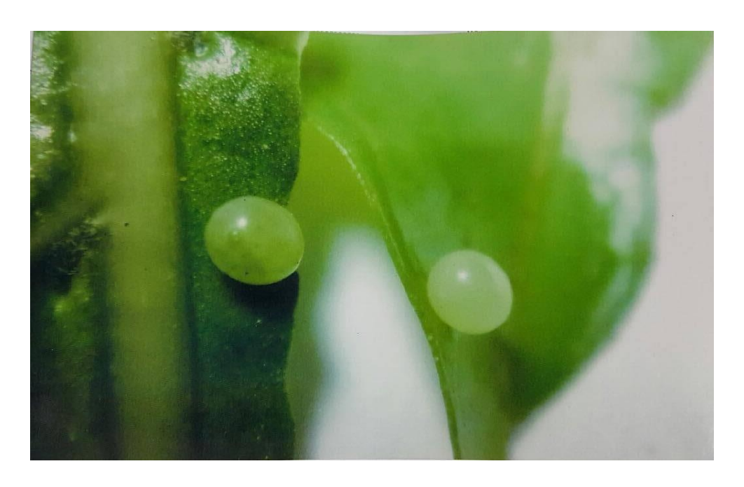
Figure 1 Eggs of M. corythus